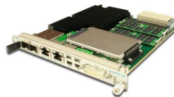
AMC725 MTCA.4 Processor