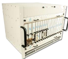
VT811 MTCA.4 Chassis