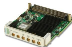
FMC210 ADC FMC