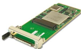
AMC515 Virtex-7 FPGA