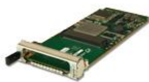
AMC517 Kintex-7 FPGA