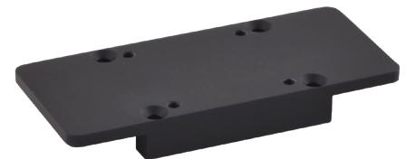
AP-CC-01 Conduction-Cool Kit

Linux ® support (website download only).