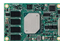
Apollo Lake COMe Type 10