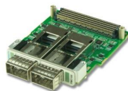
FMC108 FMC Dual QSFP+