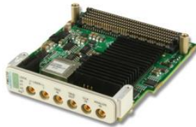
FMC210 FMC 10-bit ADC