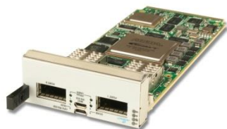
AMC534 100G FPGA