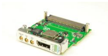
FMC223 High Speed FMC for DAC