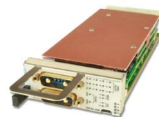
UTC020 1000W Power Module