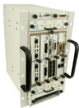
VT899 Cube Chassis