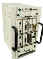
VT899 Cube Chassis