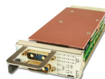
UTC020 1000W Power Module