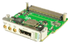
FMC223 High Speed FMC for DAC