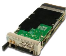
UTC004 3 rd Generation MCH for \mu TCA Chassis