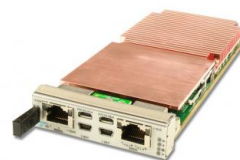
AMC723 Xeon E3-1125 Processor AMC