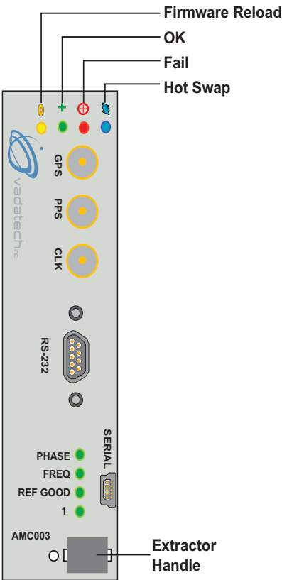
FIGURE 2. AMC003 Front Panel