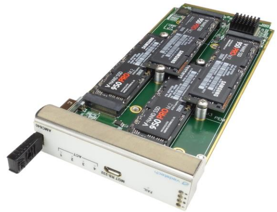
Figure 1: AMC640 Front View

The AMC640 is available in both air-cooled (MTCA.0 and MTCA.1) and rugged conduction-cooled versions (MTCA.2 or MTCA.3, contact sales for details).