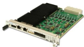
AMC522 MTCA.4 250 MSPS ADC