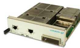
AMC738 100G Processor AMC