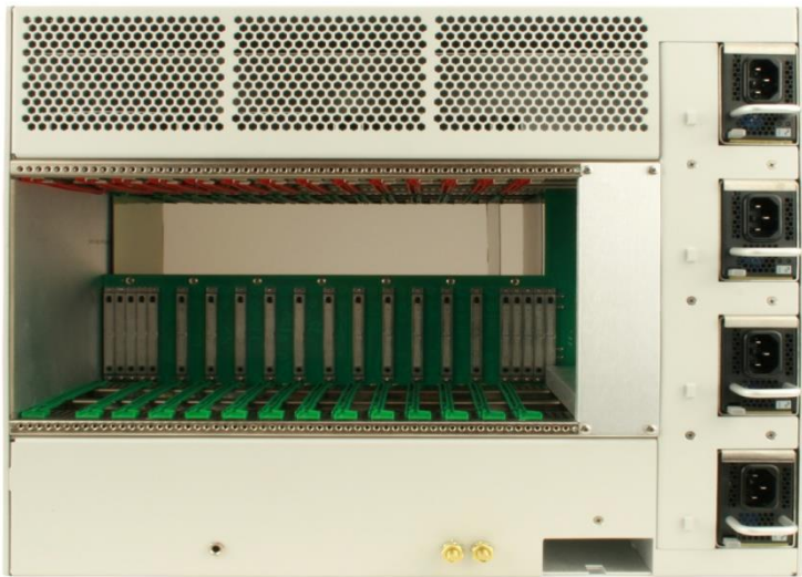
Figure 2: Chassis Layout Rear View