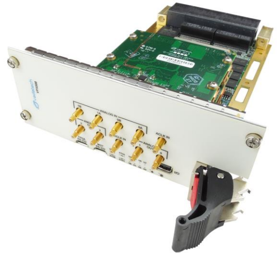
Figure 1: VPX598

Please contact VadaTech for details of Conduction Cooled versions.