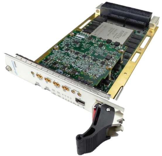
Figure 1: VPX599

Please contact VadaTech for details of Conduction Cooled versions.