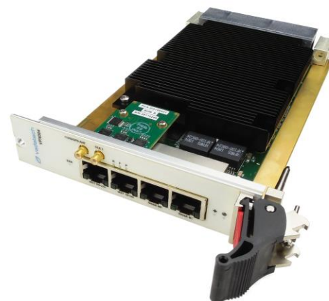
Figure 1: VPX004 Front View

The VPX004 runs Linux on its centralized quad-core CPU and is fully redundant when used in conjunction with a second instance of the module. The firmware is HPM.2 compliant which allows for easy upgrades. It provides optional Master JTAG services to the payload modules via the JSM. The VPX004 has advanced clocking features including grand master clock and high-quality clock distribution/synthesis.