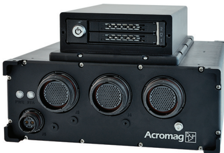
ARCX-4121-01 with optional SSD