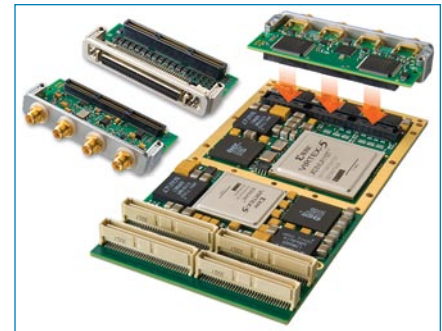
AXM extension I/O modules plug into a mezzanine connector on many Acromag FPGA boards to provide additional I/O signal processing capabilities.