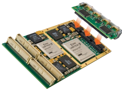
AXM modules attach to PMC Modules with user-configurable FPGAs.