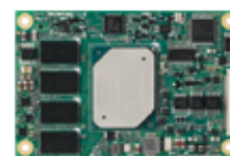
Apollo Lake COMe Type 10